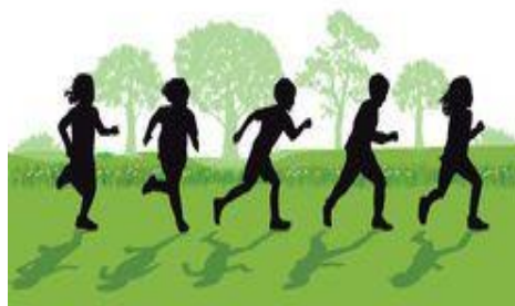
50% Donated to the Playing Field